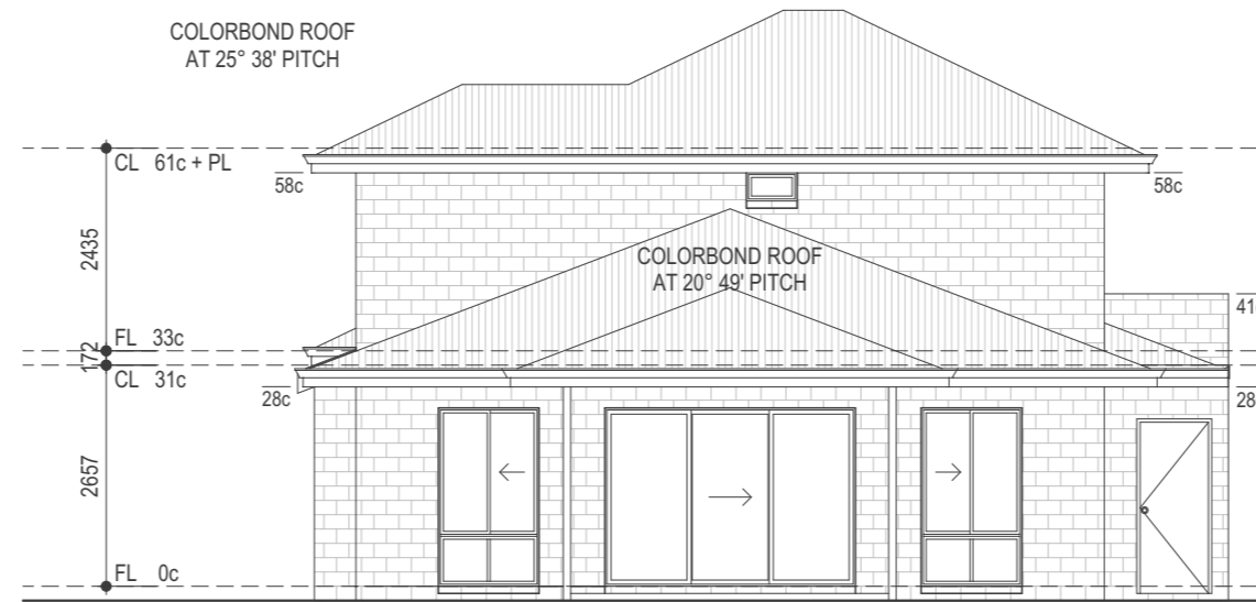
ELEVATION 3 1:100